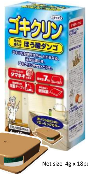
Net size 4g x 18pcs