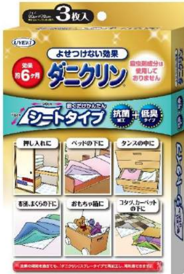
Sheet type Net size 3 sheets (78cm x 90cm)