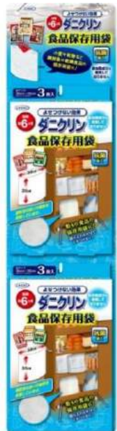
Hanger holds 6pcs