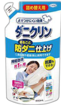
Refill Net size 450mL