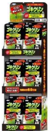
Hanger holds 12pcs