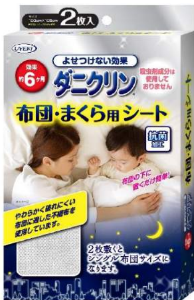
Sheet type Net size 2 sheets (100cm x 105cm)