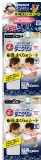
Hanger holds 6 pcs