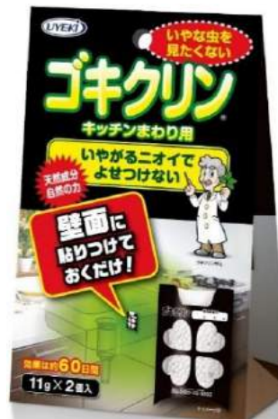
Net size 11g x 2pcs

Copaiba, also known as Copaifera officinalis , is a leguminous plant originating in Brazil and Venezuela. It has a large trunk and a smooth bark, has a lot of branches, and some can grow up to 30m tall. Specialists drill a hole in the trunk to extract non-volatile or hardly volatile resin, then the extract is distilled to make copaiba oil.