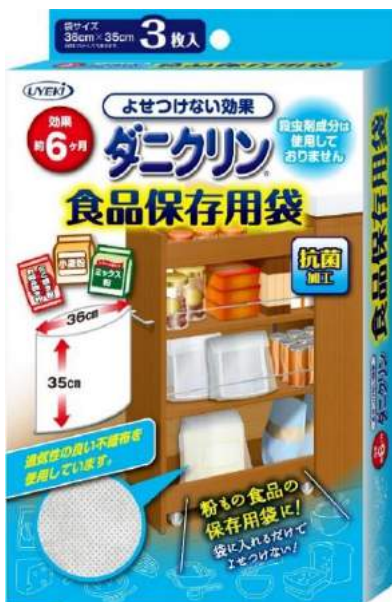
Bag type Net size 3pcs (36cm x 35cm)

Just put in the bag, and keep mites away! Great for storing opened dried food!