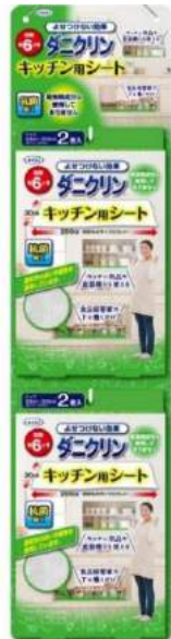
Hanger holds 6pcs