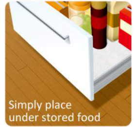
Simply place under stored food

Simply line your pantry or in the cupboard! An easy-to-use sheet type repellent!