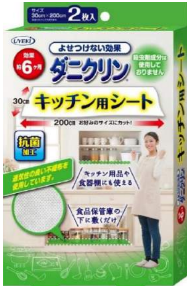
Sheet type Net size 2 sheets (30cm x 200cm)

Simply line your pantry or in the cupboard! An easy-to-use sheet type repellent!