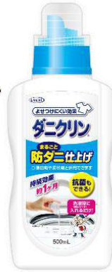
Fabric Conditioner Liquid Type Net size 500mL with measuring lid