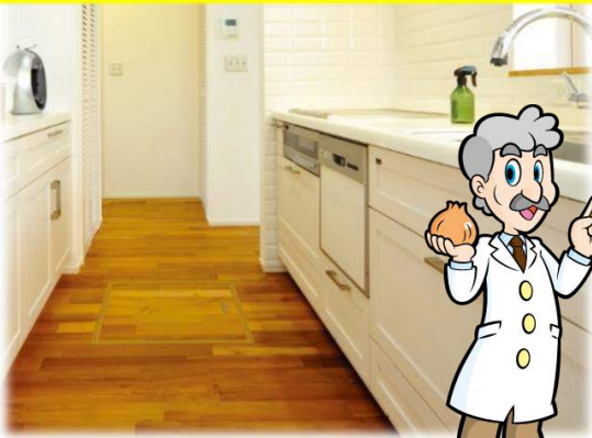
Dr. Goki Clin

The product attracts cockroaches with the smell of onions that they like, then keeps them away with the active ingredient (boric acid). It repels cockroaches from indoors, and prevents them from reproducing.