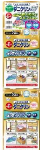
Hanger holds 6 pcs